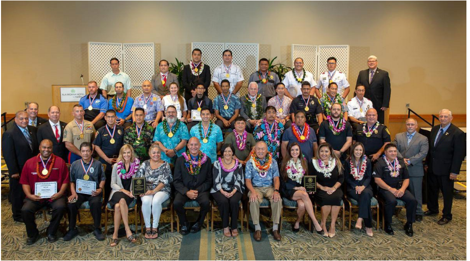
2022 TOP COPS

Visit TopCopHawaii.com/awards for the awards and photos from the award ceremonies in previous years.